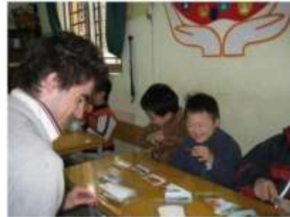
Learning with flash cards