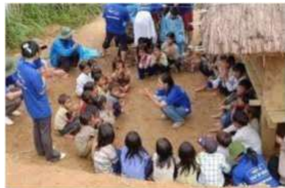
Playing with disadvantaged children

(Blue shirt is the uniform of voluntary youth)