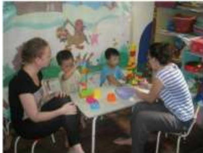
Playing with blocks