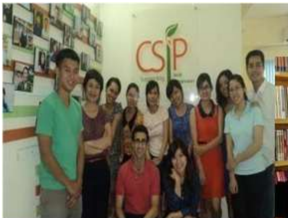
Welcome on board!

Volunteers will stay in a volunteer house, which is equipped with wifi internet, fridge, washing machine, air conditioner, provided meals as well as cooking equipment and a common area. Bunk-