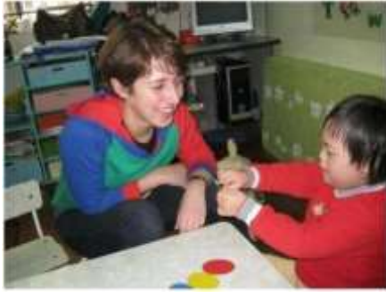
Learning about colors