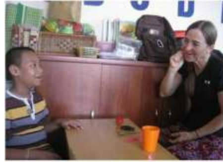
Teaching sign language to a deaf kid