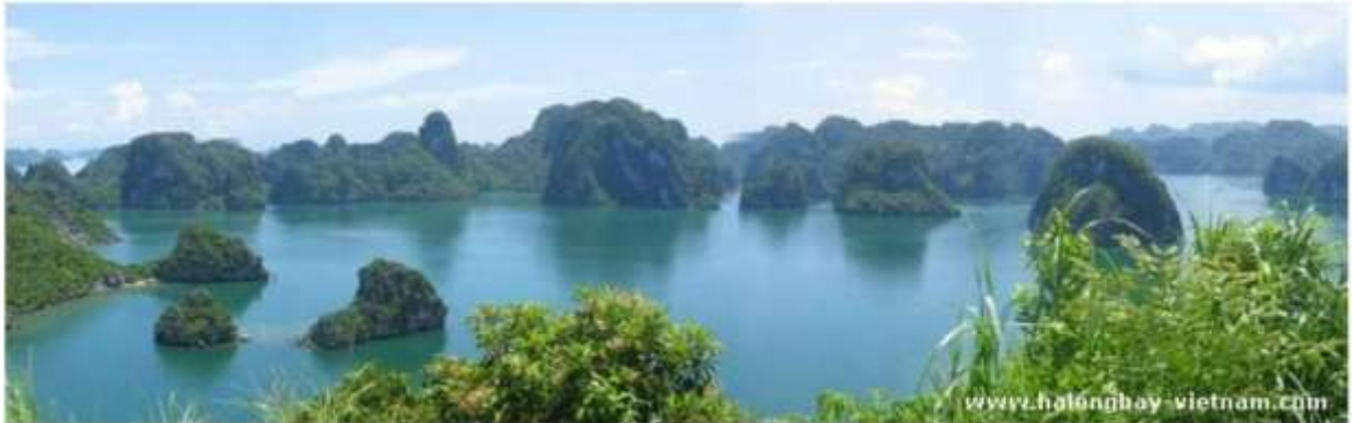
Ha Long Bay – Natural World Heritage site in Vietnam

Vietnam is in South-East Asia. The name of the country has almost become synonymous with the Vietnam War. For the Vietnamese, it is called the American War. The history of the country goes back a lot further than 'the war that wasn't won', as the Americans euphemistically call it. Vietnam is actually a country with a long history and ancient traditions. It has many historic sights and old temples.