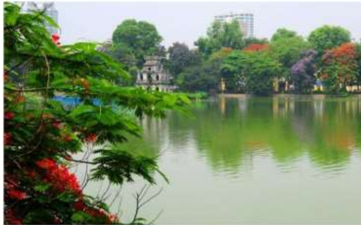
Hoan Kiem Lake in Hanoi

Central Vietnam: The climate varies from the coastal plain to the central highlands. This region tends to be warmer and more humid than the south in the middle of the year and cooler during the dry season from November to March.