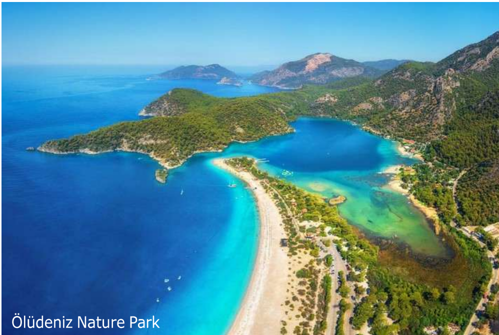
Ölüdeniz Nature Park

Renowned domestic animals from Ankara, the capital of Türkiye, include the Angora cat, Angora rabbit, and Angora goat, and from Van Province the Van cat. The national dog breeds are the Kangal (Anatolian Shepherd), Malaklı and Akbaş.