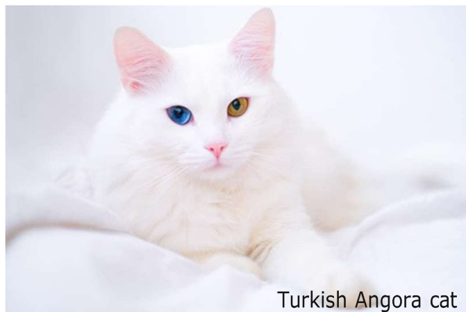
Turkish Angora cat

A white Turkish Angora cat with odd eyes (heterochromia), which is common among the Angoras.