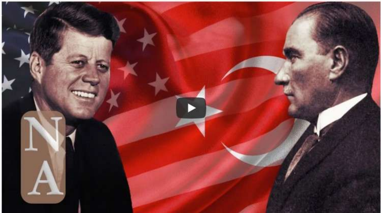
President John F. Kennedy on Atatürk

https://www.youtube.com/watch?v=s3kvtIX4dAg