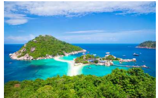
Mountains, Plateaus, Coastal Plains and Islands of the South