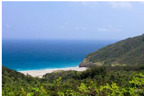
Mountains and Coastal Plains of the East