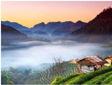
Mountains and Plains of the North

Thailand has six different types of terrain.