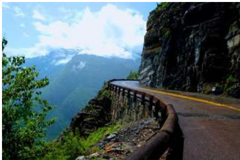
High Mountains of the West