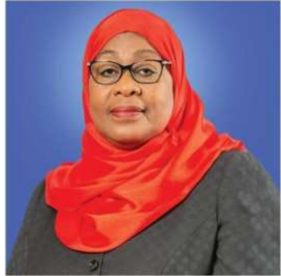
The Sixth President of Tanzania (Hon. Samia Suluhu Hassan)