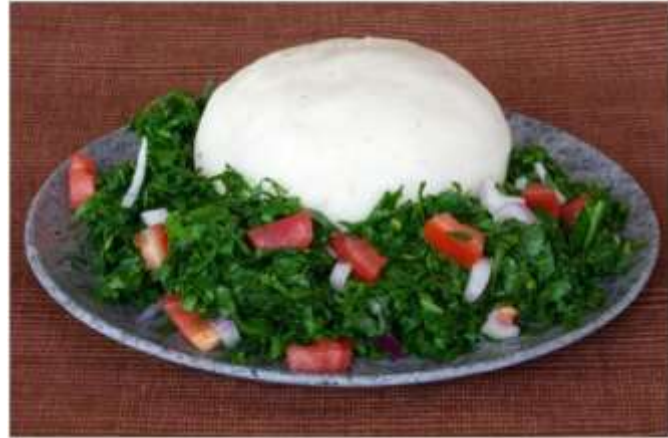
Ugali with vegetable