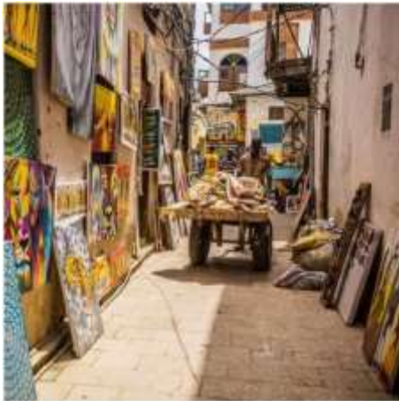
Stone Town – Zanzibar