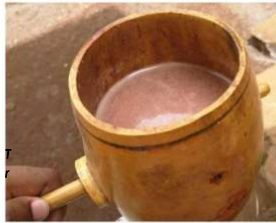
Traditional Alcohol (Mbege)