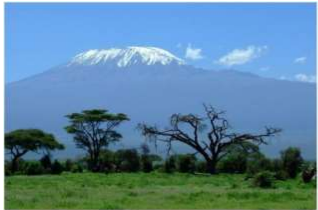
View of Mount Kilimanjaro

Lake Tanganyika is the deepest lake in Africa found in west of Tanzania (Kigoma).