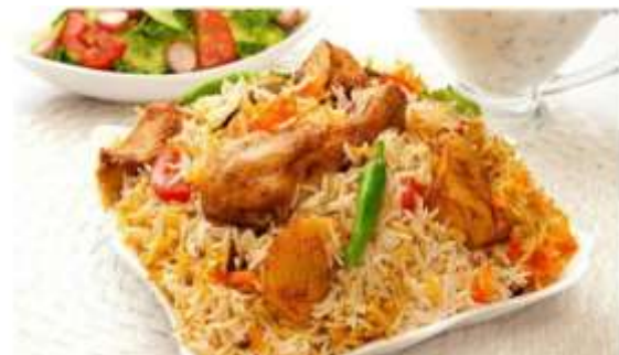
Biryani kuku (Biryani chicken)

Ceremonial occasions are usually riddled with platters of food such as the pilau (spiced rice, potato, and meat)