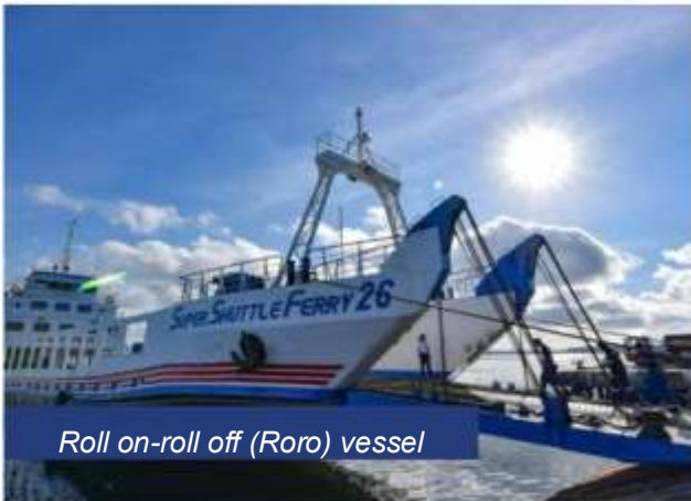
Roll on-roll off (Roro) vessel