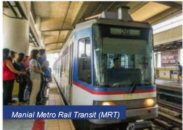
Manila Metro Rail Transit (MRT)