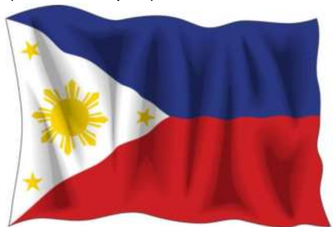
The Philippine Flag

Official Languages: Filipino and English