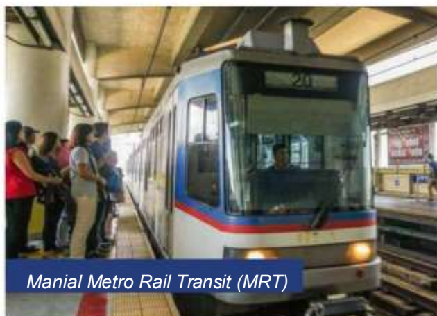
Manila Metro Rail Transit (MRT)