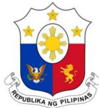
Philippines Coat of Arms

Most government offices establish regional offices to serve the constituent provinces. The regions themselves do not possess a separate local government, except for the Autonomous Region in Muslim Mindanao.