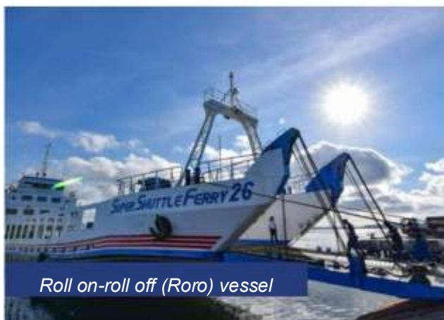
Roll on-roll off (Roro) vessel