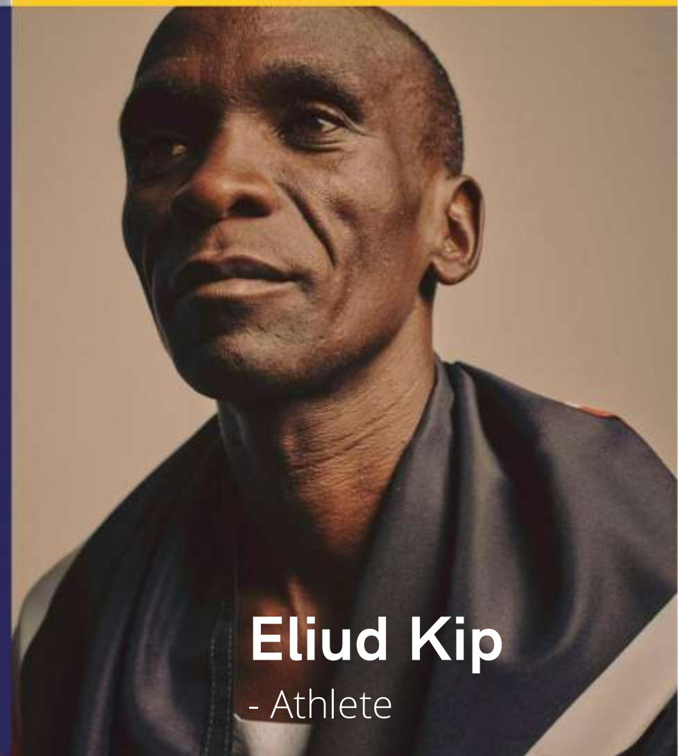
Eliud Kipchoge - Athlete

People in these areas primarily speak their vernacular language. In urban areas traditional influence is minimal and there is a lot of western influence.