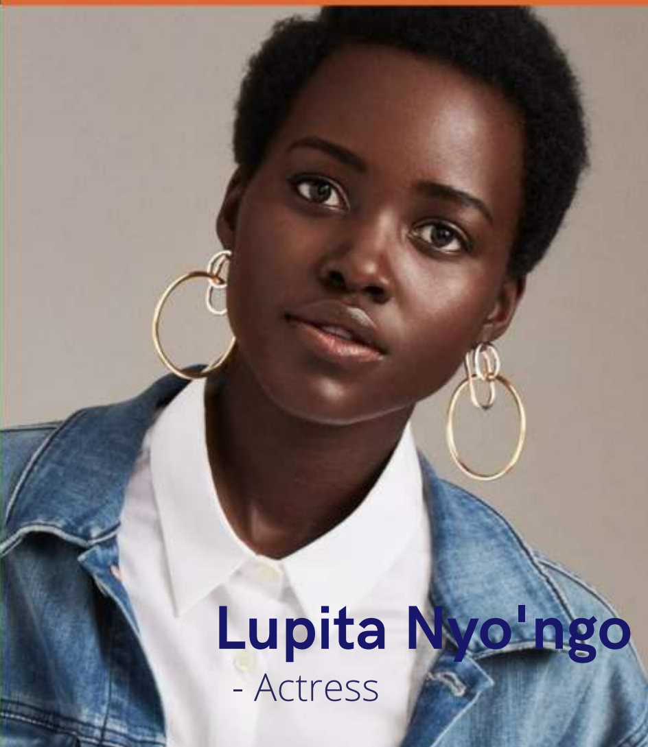
Lupita Nyong'o - Actress

Kenya's population is approximately 54 million. Most Kenyans dwell in urban centers whereas the North & North East part of Kenya has low population due to its arid and semi-arid climate that is less conducive for human settlement. The rural population is confined to the fertile areas and lives on agriculture.