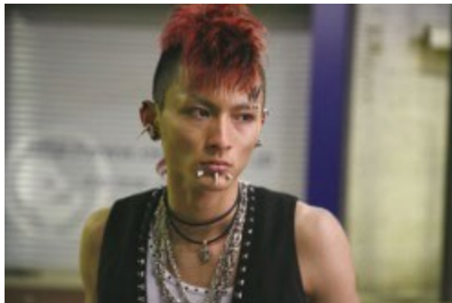
Too much piercing on your face or other body parts (Only ears are acceptable)