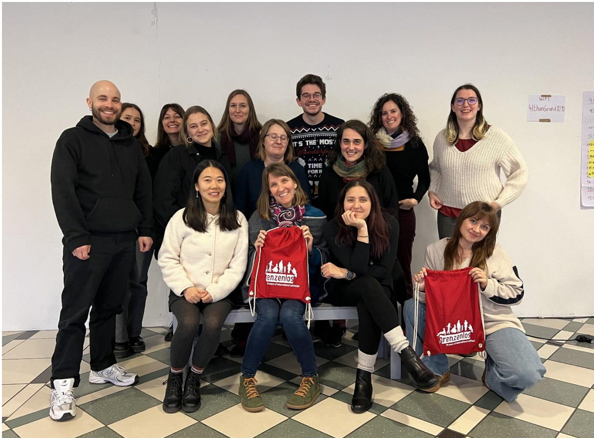
Grenzenlos team in 2024